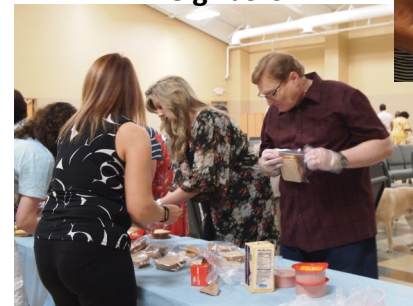
Lots of happy & busy hands