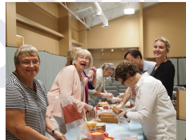
363 Sandwich Project to feed our homeless neighbors.

We had a special collection for Churches of Christ Disaster Relief – specifically for those impacted by Hurricane Florence. If you would like to contribute to this effort, you can simply write “CoC Disaster Relief” or “Hurricane Florence” in the memo line on a check, contribute in the appropriate envelope on our Givelify app, or put cash in an envelope marked for “CoC Disaster Relief” or “Hurricane Florence”.