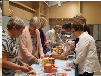
FRIENDS’ DAY 2018 After a great worship assembly and sharing lunch, we made sandwiches