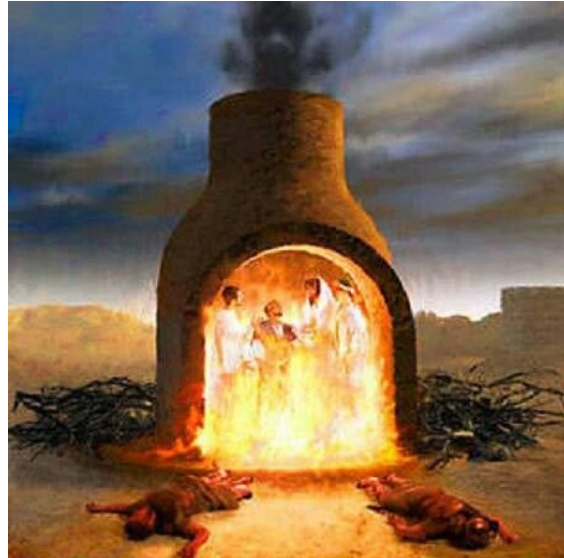
Pin on Art Gallery 4 Biblical Art

Do not be afraid, for I have ransomed you. I have called you by name; you are mine. When you go through deep waters, I will be with you. When you go through rivers of difficulty, you will not drown. When you walk through the fire of oppression, you will not be burned up; the flames will not consume you. For I am the LORD, your God, the Holy One of Israel, your Savior.