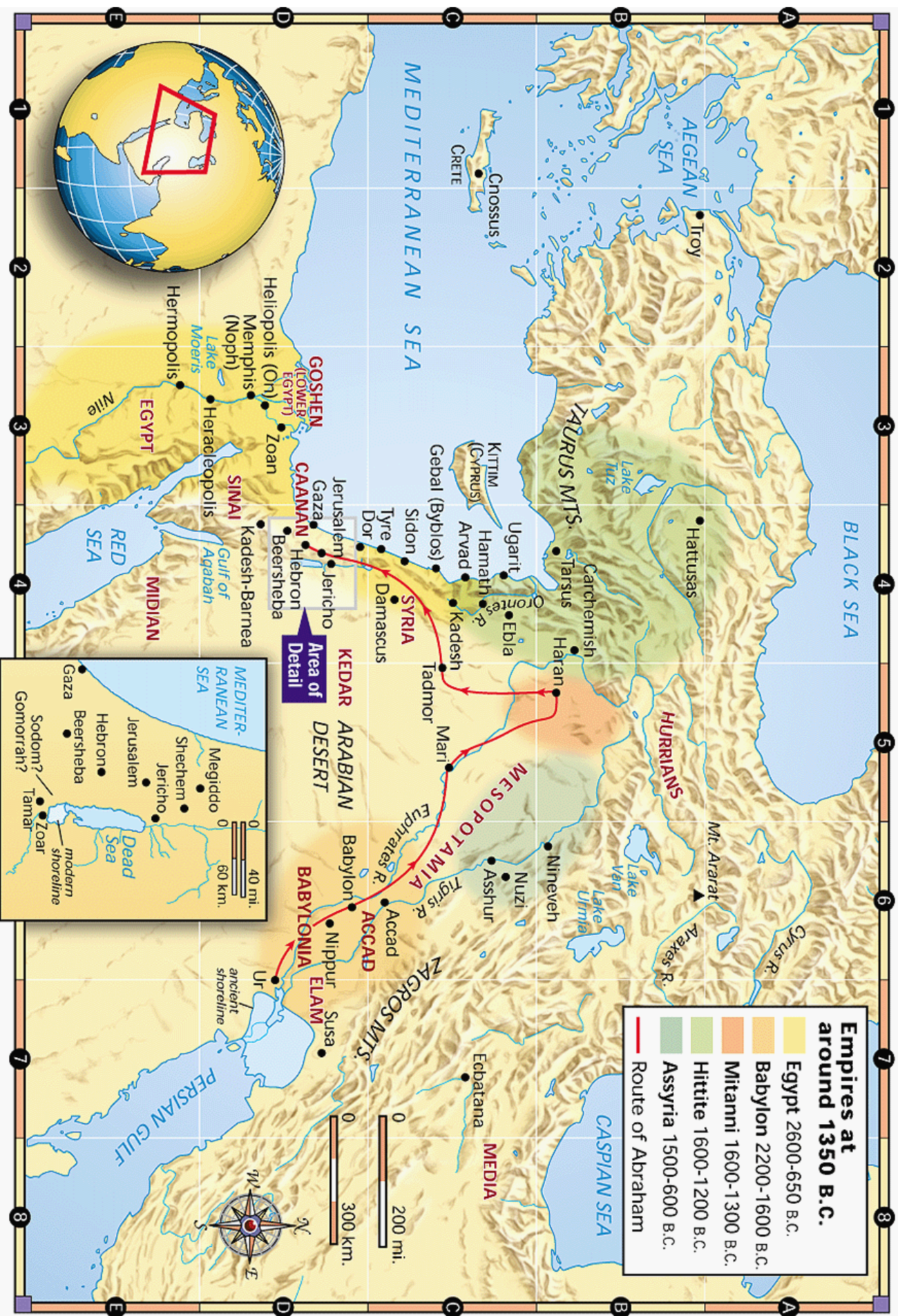
Map 1 - The Ancient Near East, 1800 to 1400 B.C. (from CEV Maps, Copyright © 1995 American Bible Society. All rights reserved.)